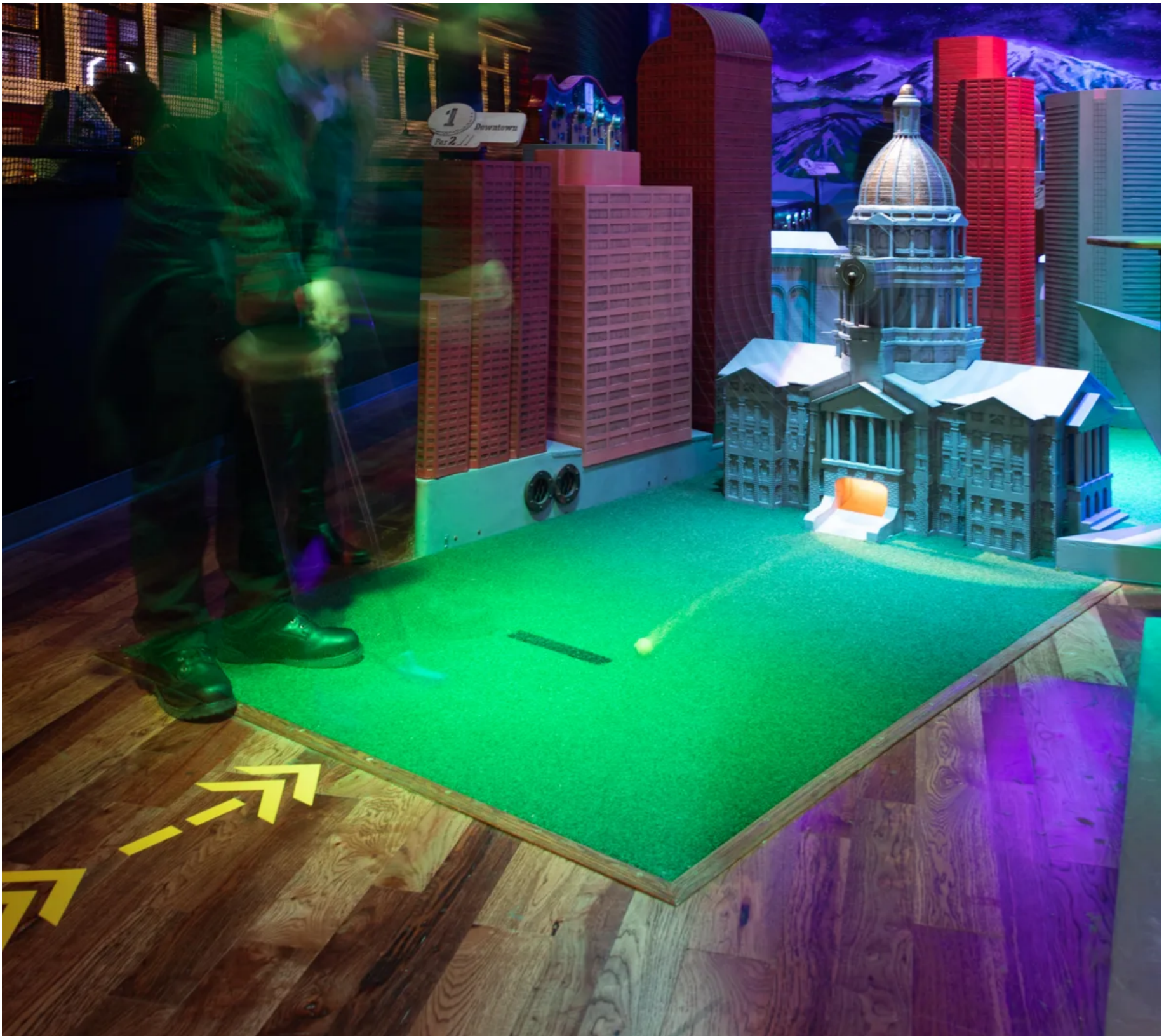
A player putts through the downtown Denver hole on one of Urban Putt's two, 9-hole courses.