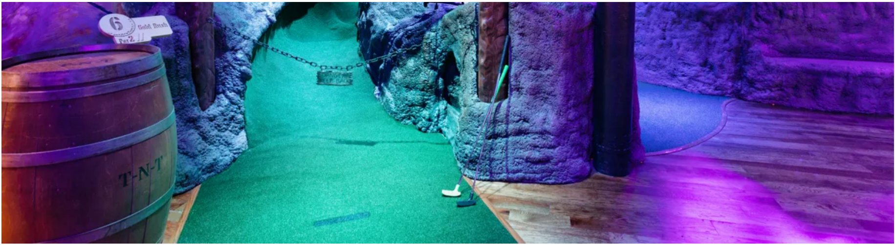
The Gold Rush hole at Urban Putt takes players through Colorado's gold mining heritage.

In addition to the two, 9-hole courses, Urban Putt features a chef-driven, scratch kitchen and a bar serving local craft beers and custom tap cocktails. The Urban Putt space has been carefully and lovingly restored as the next chapter of Denver's historic City Cable Railway Building and showcases local favorite Streetcar #54 once again proudly serving Denver as a dining car and party room.