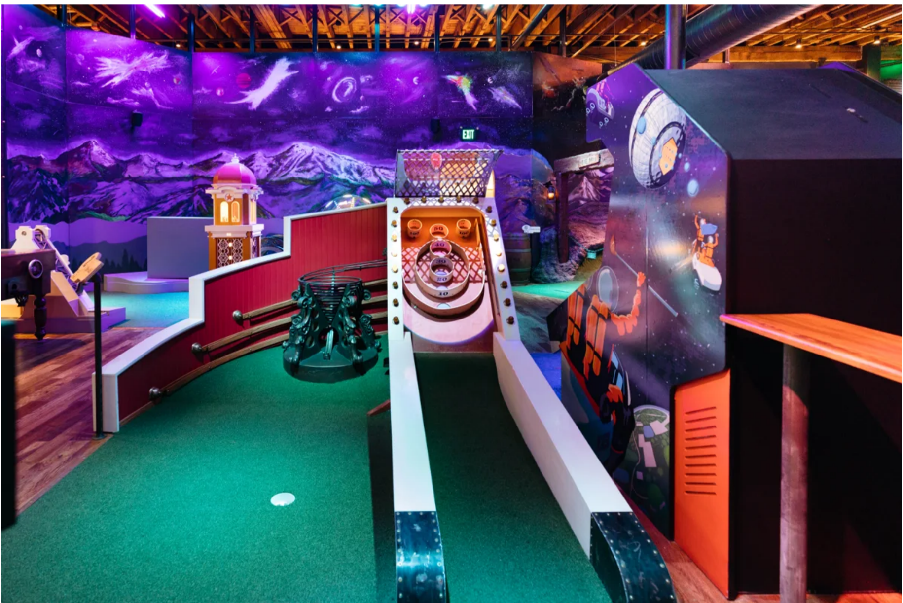
Try your luck on the skee-ball hole at Urban Putt!

Urban Putt is available for parties, corporate events, and fun-seekers of all ages!